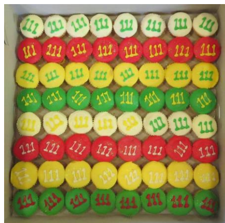
All our children received a Birthday cupcake in celebration of the occasion.