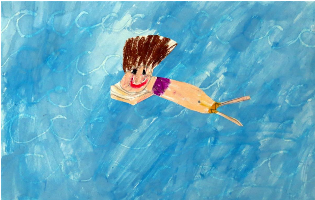
Grade I art.