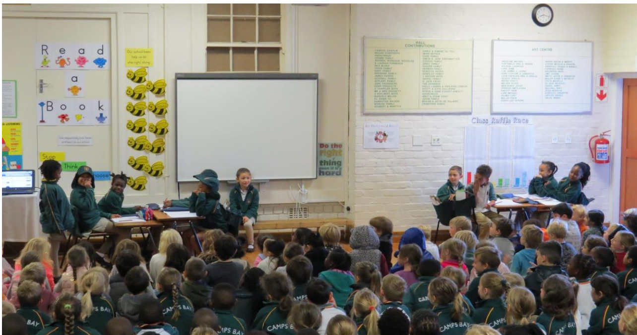
A wonderful little play about our school was held in assembly. The learners reminded all our children of how to do the right thing even if it is hard!