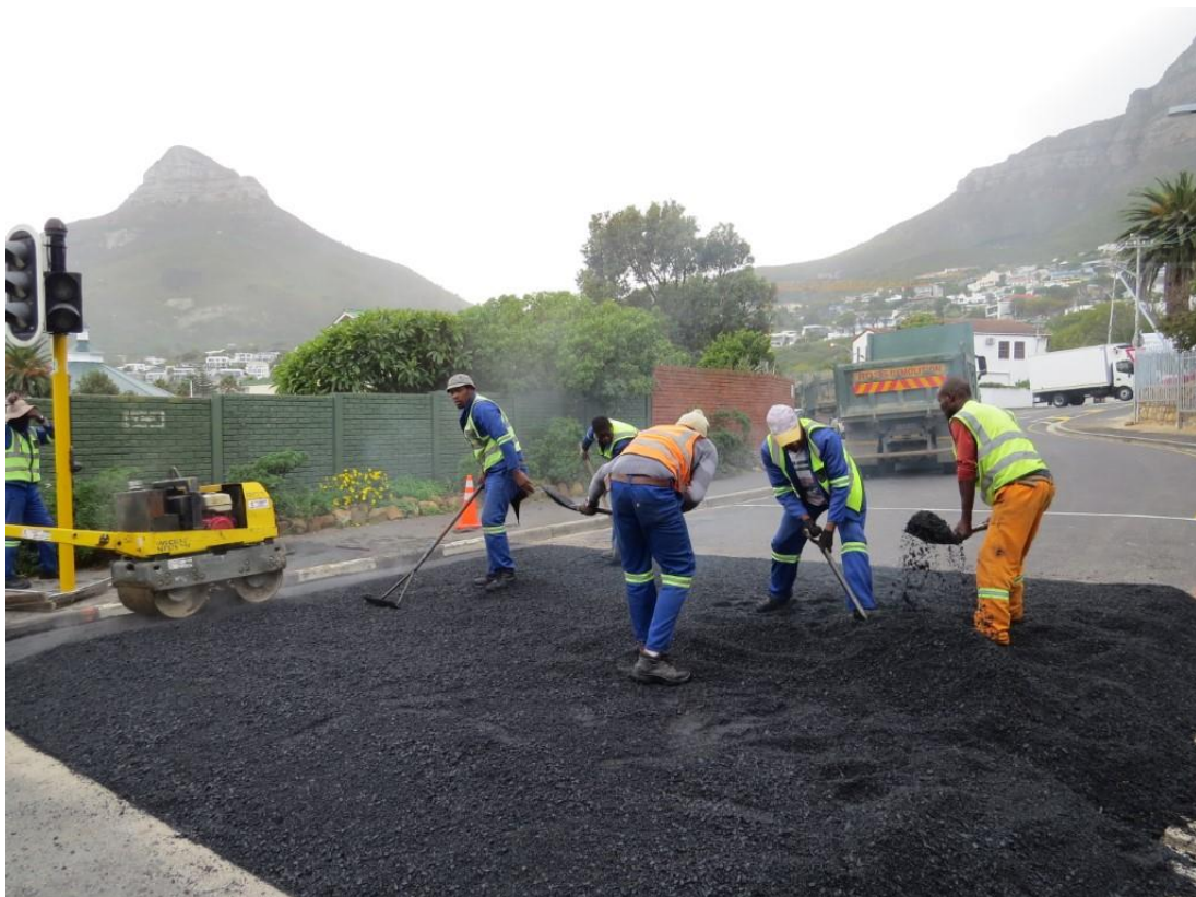
A lovely surprise: - A speed bump placed in The Drive, Camps Bay on Friday, 03 May 2019