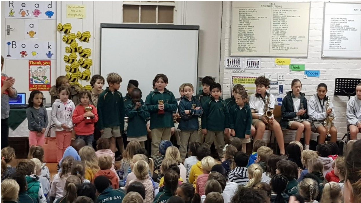
Assembly: We love celebrating our learners and all their achievements!