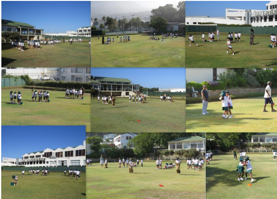
A morning of fun activities at the new Gr R premises.